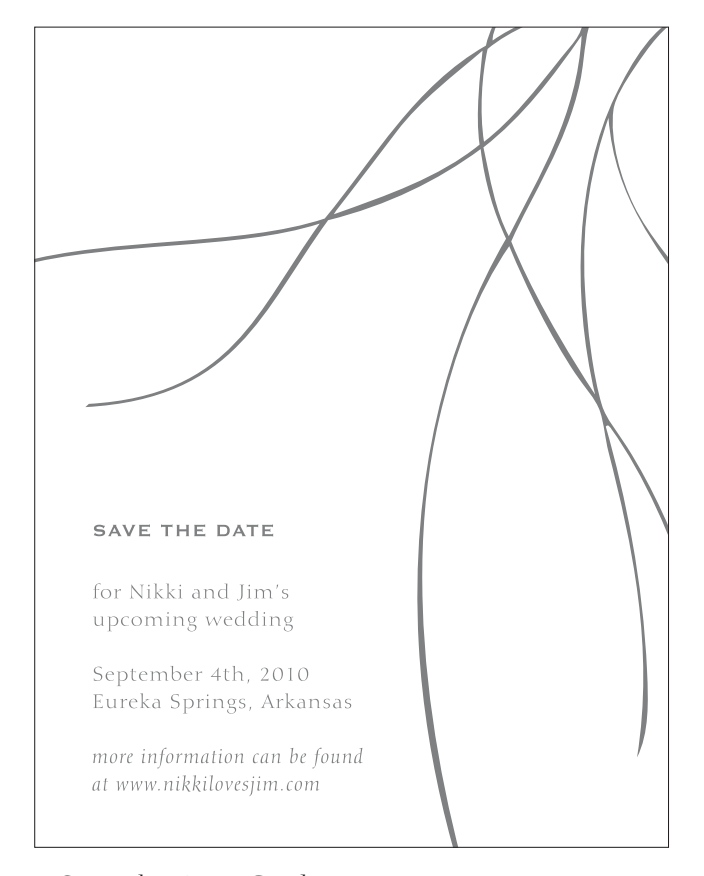
Save the Date Card