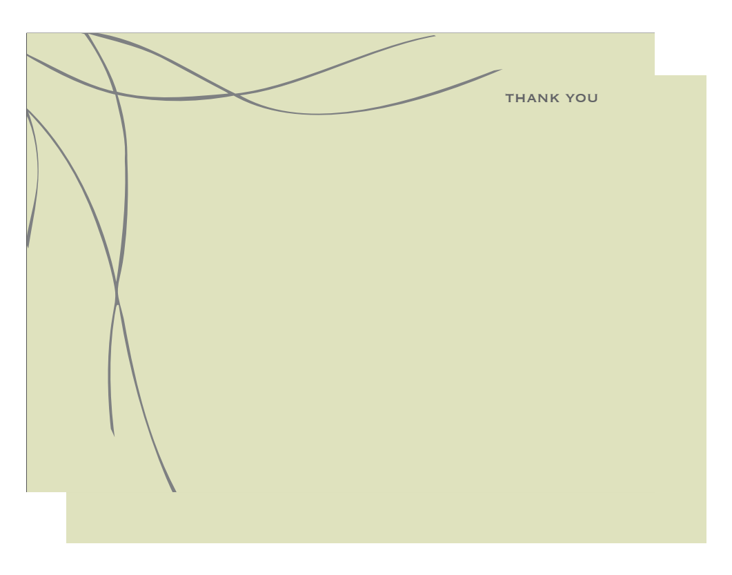
Thank You and Blank Envelope