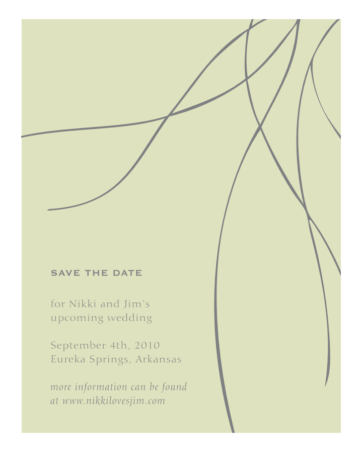
Save the Date Card